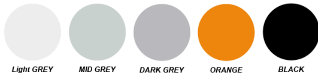
Light GREY MID GREY DARK GREY ORANGE BLACK