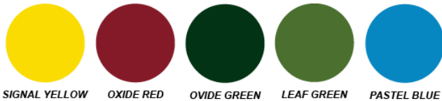
SIGNAL YELLOW OXIDE RED OVIDE GREEN LEAF GREEN PASTEL BLUE